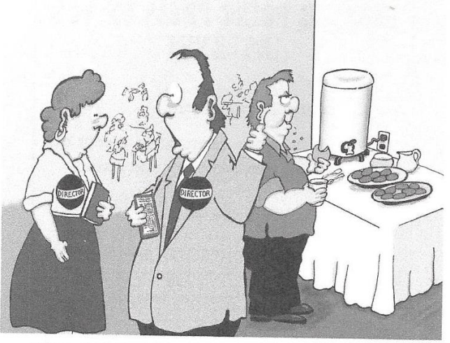
" Come to think of it, have you ever actually seen this guy at a bridge table?"